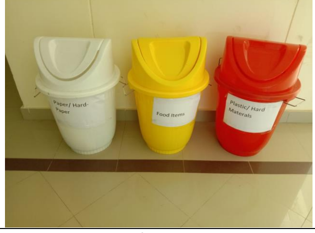
2-Seprate Containers for Organic, inorganic waste collection