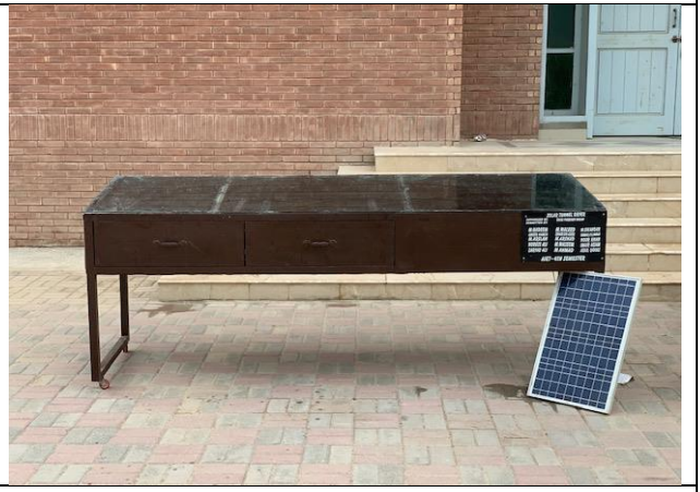
4-Solar Tunnel Dryer