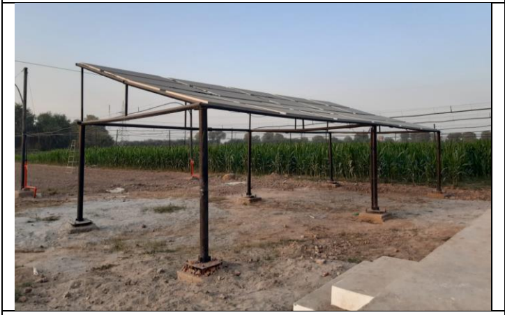
3-PV System for Irrigation