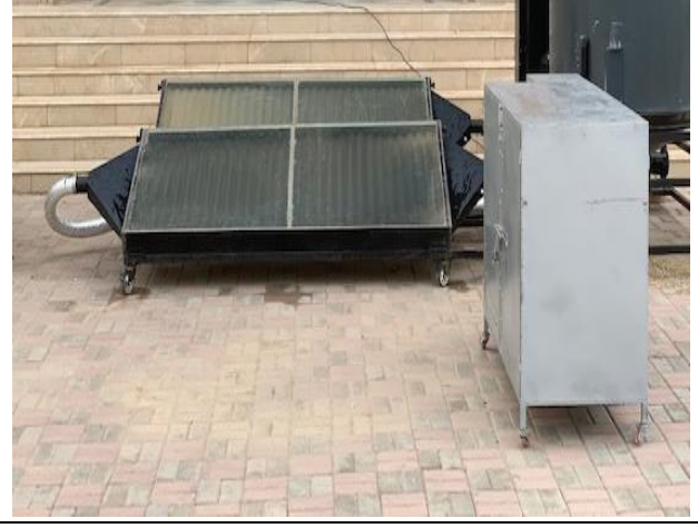
6-Solar Desiccant Cabinet dryer for fruits