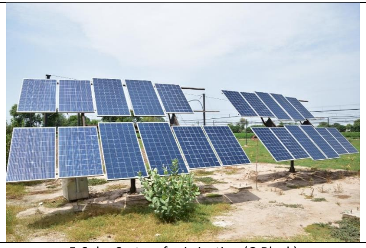
5-Solar System for irrigation (C-Block)