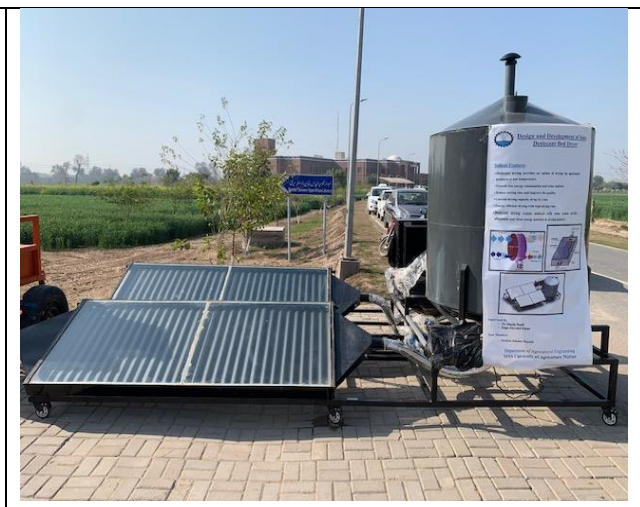
8-Solar Desiccant Dryer for grains