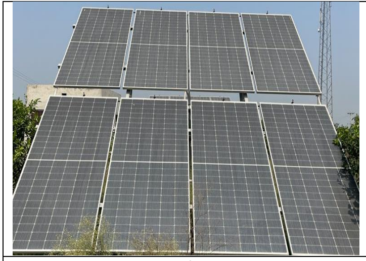
1-PV System for Irrigation