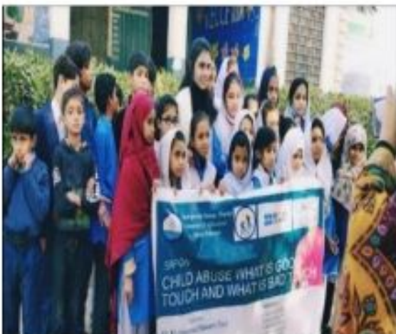
Social Action Project on "Child Abuse what is good and bad Touch".