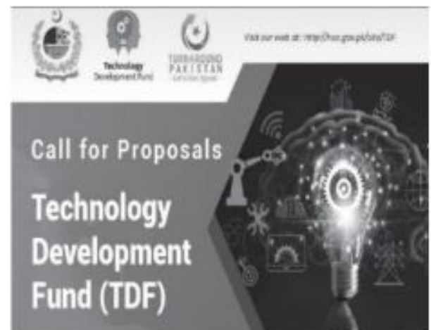
Call for Proposals.