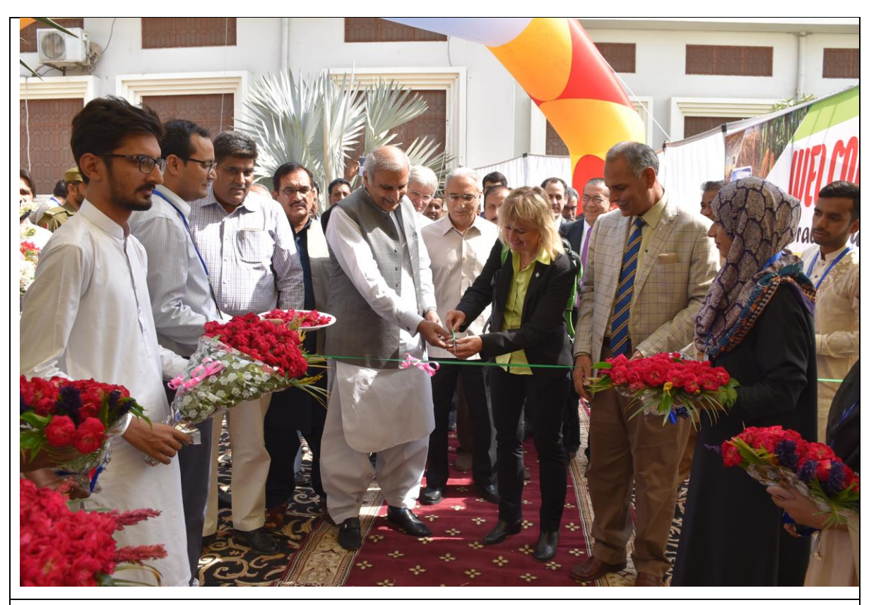
Chief guest along with foreign guests is inaugurating the conference