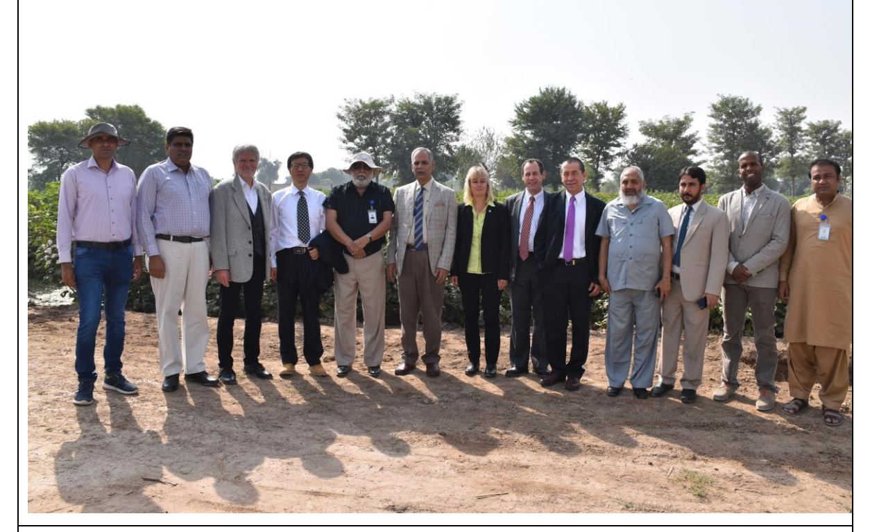
Visit of foreign guests to MNS-UAM Experimental Farm