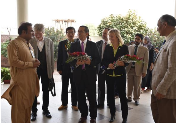
Arrival of international delegates