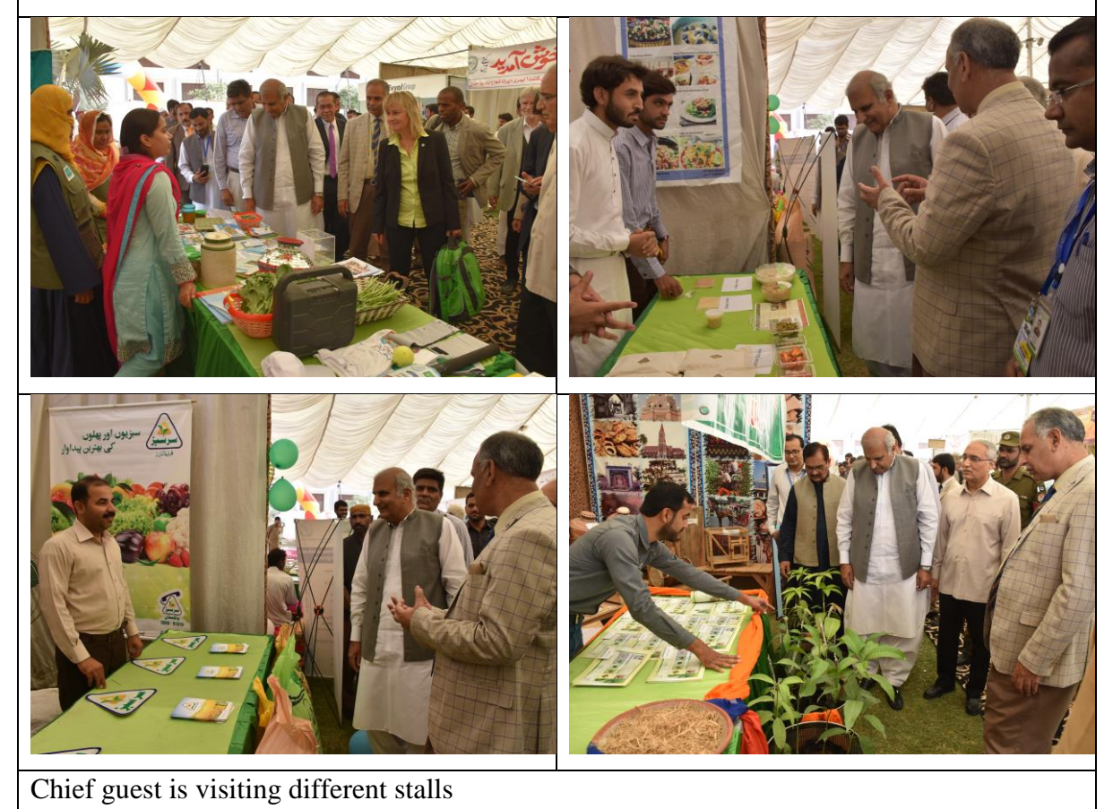
Report: International Conference on Climate Smart Agriculture: The Way of Farming for 21st Century