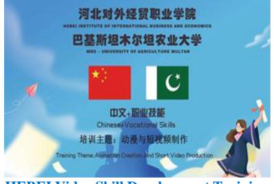
HEBEI Video Skill Development Training