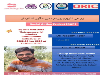
Role of Grapes Cultivation in Agriculture Entrepreneurship

ORIC MNSUAM got 3<sup>rd</sup> Position in Pakistan Under WURI.