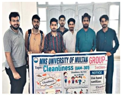
Social Action Project on Cleanliness