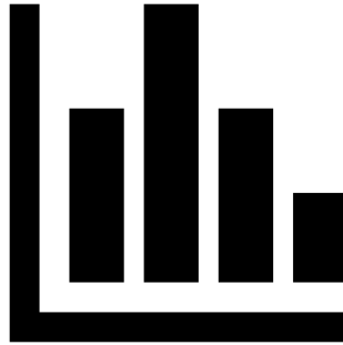
Figure 2.1: Give caption of figure (12 Font size)