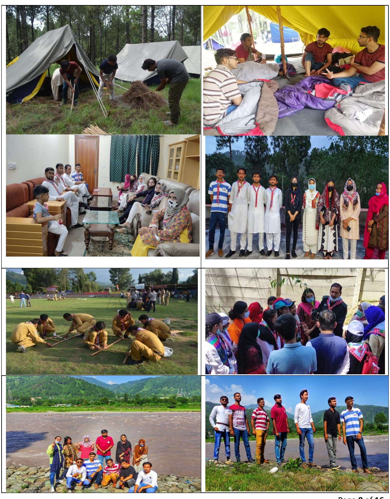
Page 8 of 16

Rovers also enjoyed a trip to River Kunhar with president RSU-MNS-UAM after closing ceremony and then way back to sweet home with lot of memories.